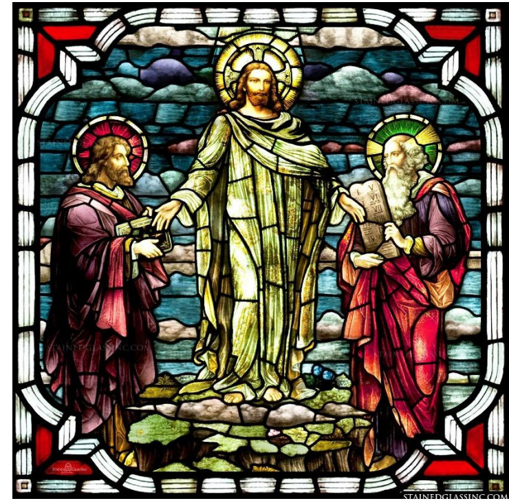
"An Unveiled Life"